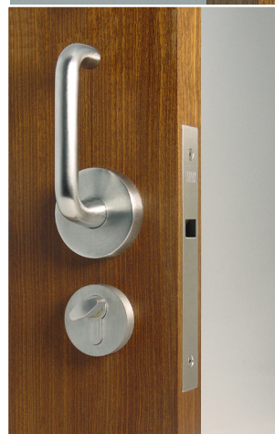
CL100 Lever with Turn fitted to a timber veneer door.