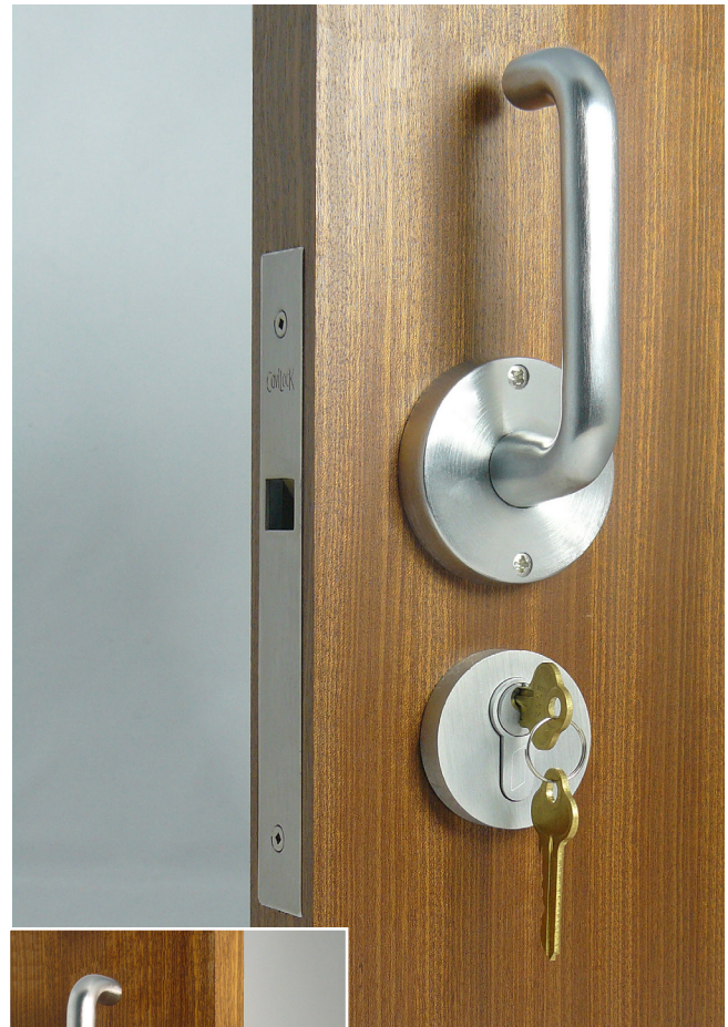
CL100 Lever with Key Locking fitted to a timber veneer door.