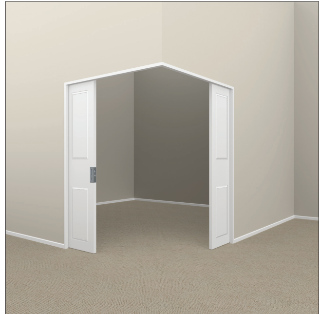
View looking up at various CS CornerMeeting track configurations

This detail requires nomination of a lead door, as one edge will typically butt into the face of another.