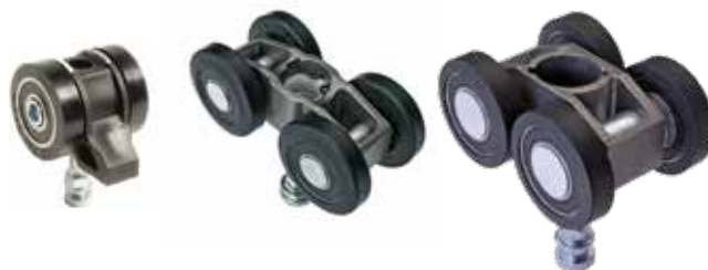
↑ M6 Carriage ↑ M8 Carriage ↑ M10 Carriage