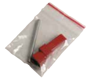
↑ LaviLock indicator kit