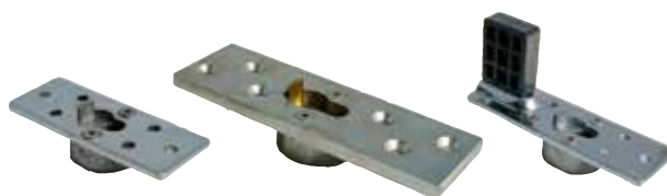
↑ M6 / M8 ↑ M10 ↑ Mounting plate with stop

Machined stainless steel mount plates are available on request.