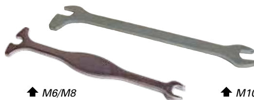
↑ M6/M8 ↑ M10

Our spanners have been designed to make adjusting door heights and removing doors from the cavity a simple exercise. These are available for M6, M8 and M10 track and carriage systems.