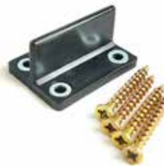
↑ 23mm T-Guide