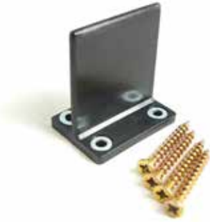
↑ 50mm T-Guide