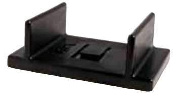
↑ WardrobeSliders T-Guide