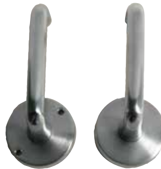
↑ Lever handles