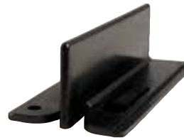
↑ Standard T-Guide

The T-Guide for timber surface sliding doors is available as a replacement in either a standard height or extra-high for greater floor clearance.