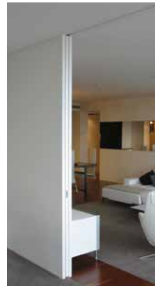
↑ 2 - SquareFormed cavity slider in an apartment.

This complete solution provides a seamless, clean flow around doorways and is ideal for large room dividers or areas such as hallways where you want a discreet door that is rarely closed.