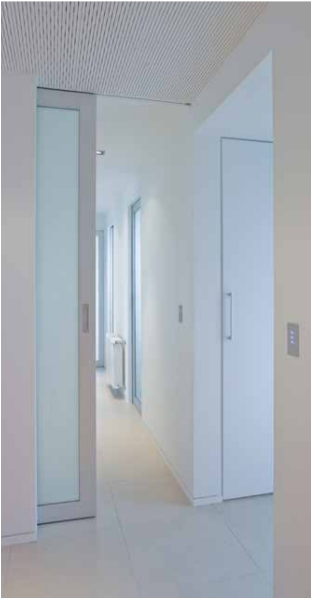
↑ 1 - SquareFormed cavity slider with NewYorker door.